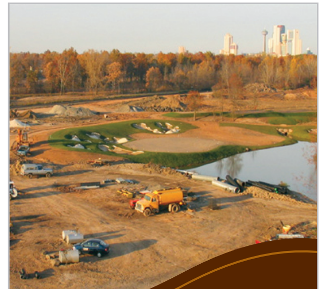
Thundering Waters Golf Course

Planning & Development / Business Development 4310 Queen Street P.O. Box 1023 Niagara Falls, ON L2E 6X5 (905)356-7521 Ext. 4298 (905)356-2354 Fax www.niagarafalls.ca