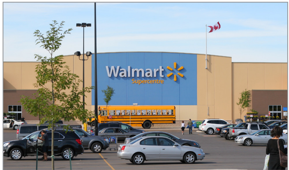
Walmart Supercentre is the anchor tenant at the newly-opened Oakwood Smart Centre retail complex.

"Recent improvements to highway access and the widening of Oakwood Drive have contributed to a significant number of new