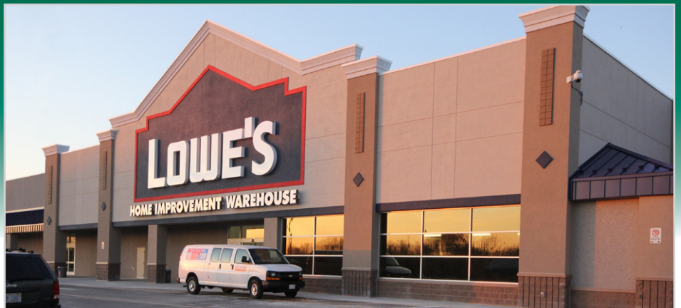
Construction nears completion at the site of a new Lowe's Home Improvement store located at the corner of McLeod Rd. and Montrose Rd. in Niagara Falls.