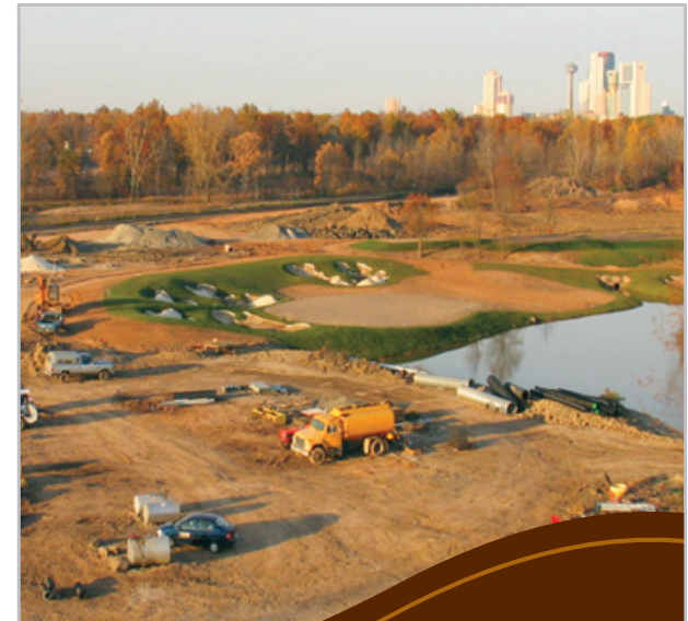
Thundering Waters Golf Course

Planning & Development / Business Development 4310 Queen Street P.O. Box 1023 Niagara Falls, ON L2E 6X5 (905)356-7521 Ext. 4298 (905)356-2354 Fax www.niagarafalls.ca